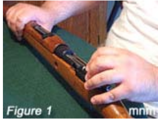
Figure 1 shows a typical Mauser.