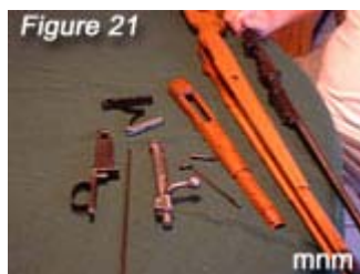
Figure 21 shows the disassembled Mauser.