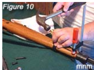
Figure 10 shows my trick for removing the front barrel band without marring the stock. If you don't have a clamp - you need three hands and to be double jointed. Once the clamp is holding down the barrel band spring, tap lightly on the front barrel band and it will slide forward.

Figure 11 shows front barrel band removed.