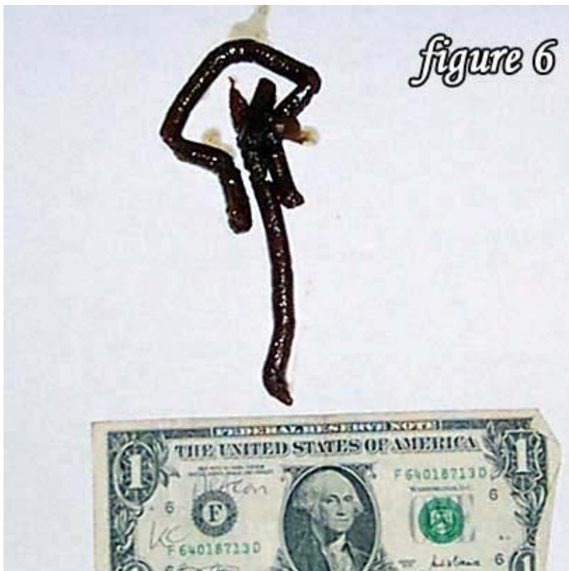
This “Grease Turd” was pushed from the barrel of a 03/ Springfield received from the CMP!

Stocks, Stock Fit & Cracks: While the action is out of the stock for cleaning, it's time to give the stock a critical examination. Often stocks are mismatched to actions. Arsenal rebuilt rifles are very prone to be mismatched, Turk Mauser's and the various CZ's in particular. The bug-a-boo here is bedding. If the action is shifting in the stock after every shot, then only mediocre accuracy will result. Any cracks in the wood mean a misfit. Repairing cracks isn't hard, this article tells you how, http://www.surplusrifle.com/shooting/fillingcracks/index.asp . Although not necessary all the time, you could glass-bed the recoil lug to keep the action from moving.