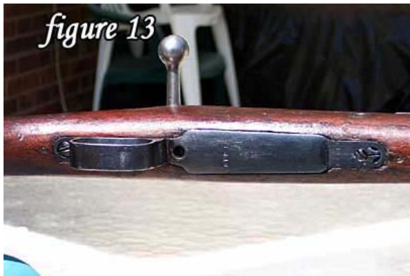
This action has locking screws!

Different geographical areas of the country will also play havoc with screw tightness. A wood stock will absorb moisture and humidity like a sponge and expand, then constrict in times of dryness. This is less a problem in the consistently dry climate of the west. I can't count the number of times a fellow is shooting either a Mil-Surp or sporter on the range, and having shots going wild for no apparent reason. A quick check of the screws found action, and often scope mount screws, loose! Just be aware that checking screw tightness before shooting is always good practice.