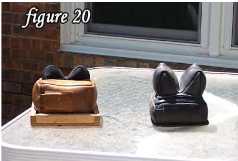
Bald Eagle Bunny Ear bag & Caldwell all leather Rabbit Ear bag.

Rear Sandbags: Commercial rabbit & bunny ear rear sand bags need a very stiff base or they tend to rock. A rocking rear bag will also throw shots. An inexpensive "Bag Stabilizer" can be acquired, or a homemade wood tray will work.