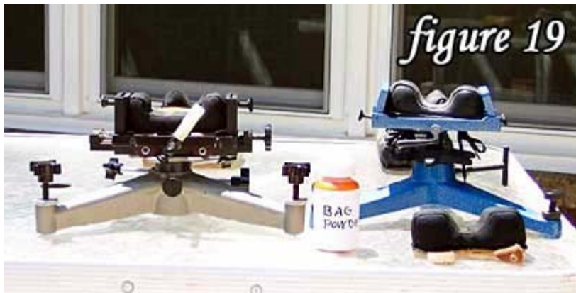
Bald Eagle & Caldwell front rests.