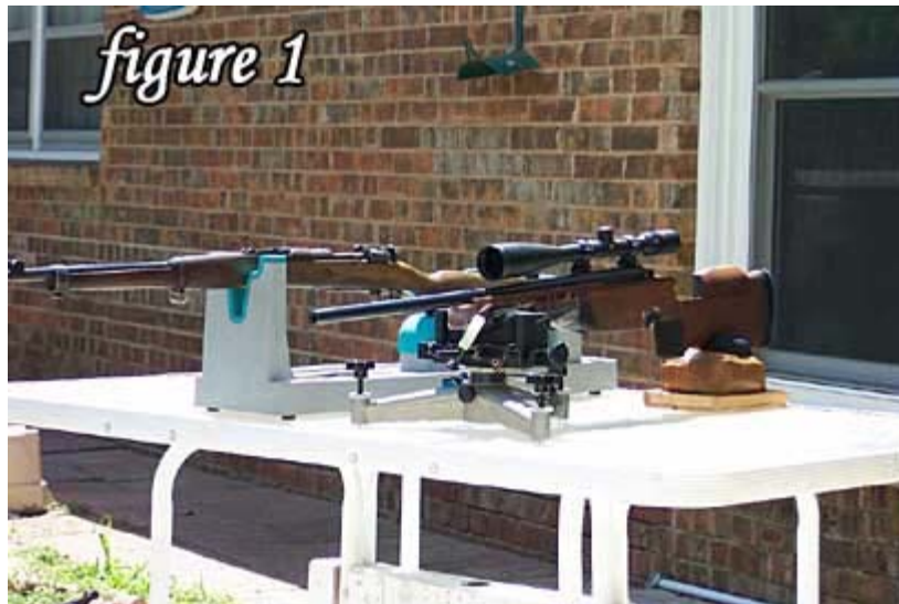
Two different breeds of cat! Tikka Sporter (right), fully adjustable stock & variable power, AO scope, this rig adapts to the shooter. Turk Mauser is a different story, the shooter adapts to the rifle.

Mil-Surp arms weren't designed to be MOA (minute-of-angle) bench guns. They were designed to engage an enemy soldier. However, I have seen bolt-action Mil-Surp guns cut MOA groups. It's not impossible. I've even shot a few (very few) MOA Mil-Surp groups myself. However, I know keen eyed shooters who can do it on a regular basis.