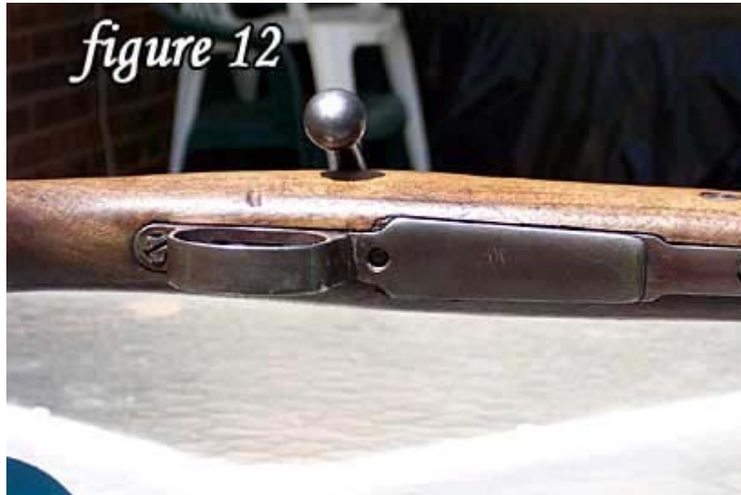
No locking screws, keep the guard screws tight!

http://www.surplusrifle.com/reviews2005/wepscrewdriver/index.asp has the full story on a complete gunsmith screwdriver set.