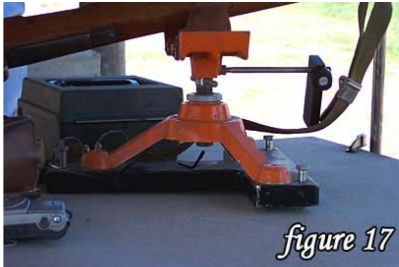
This small footprint rest has been bolted to a steel "T" to make it more stable.

have aluminum Caldwell "The Rock" rest from Midway USA . It has a fairly wide footprint, and is really very good. I put small shot bags filled with sand across the legs of the rest to give it additional weight & stability. A fellow I know turned his aluminum Caldwell rest over, and poured lead into the open areas on the backside of the legs. It's plenty heavy now.