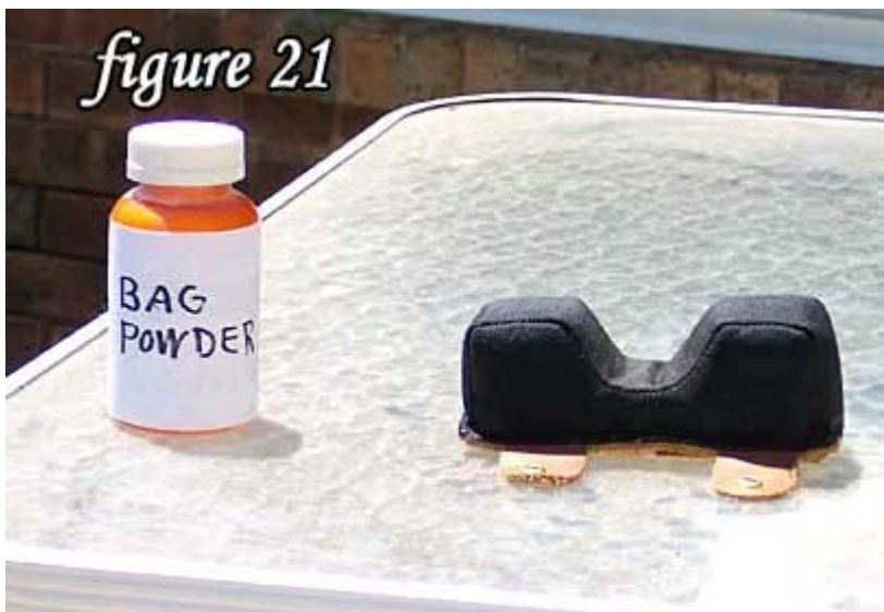
Bag powder & extra front bag.

Rear Sandbags: Commercial rabbit & bunny ear rear sand bags need a very stiff base or they tend to rock. A rocking rear bag will also throw shots. An inexpensive "Bag Stabilizer" can be acquired, or a homemade wood tray will work.