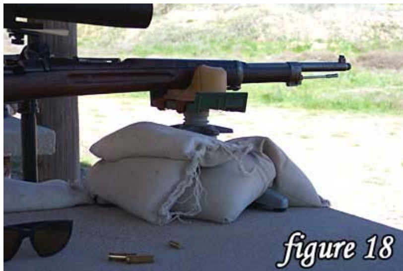
This plastic rest is light, a few sand bags give it stability.

I've seen some novel ideas other fellows have come up with to deal with a rest that has a small footprint. One fellow welded a large "T" out of 1 inch thick by 2 inch wide steel stock and drilled & tapped it so he could screw the legs of his small footprint rest down. Another did the same with a one inch thick piece of aluminum plate, about 15 inches square. Both these rests are now very stable and designed for serious bench rest shooting. Plastic rests definitely need to be sand bagged down. Alternately a front rest that is all bag can be used. Caldwell has the "Deadshot" rest, see Ted's review of this item in the article http://www.surplusrifle.com/reviews2005/deadshot/index.asp .