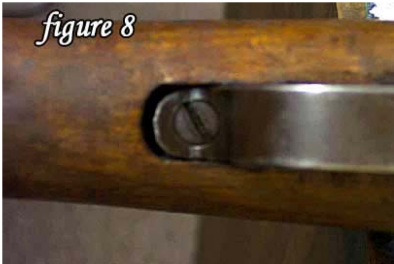
Notice the poor wood to metal fit

Many countries mixed parts while the rifles were in arsenal or depot rebuilding programs.