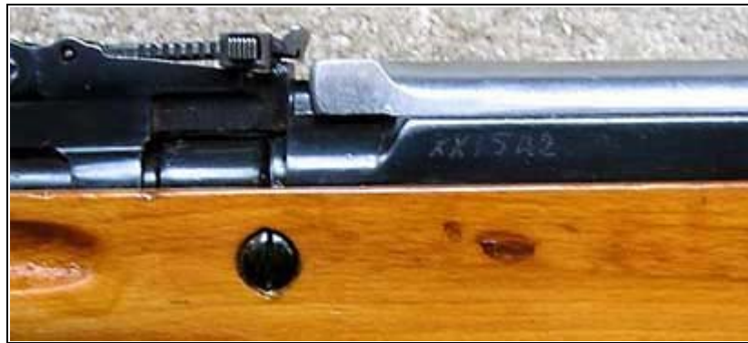
Undated rifle serial number.

The stocks on Albanian SKS are usually of two color types. Rifles manufactured in 1967 and 1968, with some of the 1969 ones, were of a much darker color than all prior years.