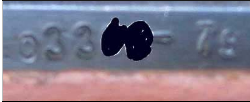
Photo of 1979 serial number