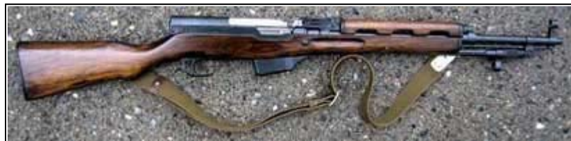
Example of 1968 rifle

The stocks on Albanian SKS are usually of two color types. Rifles manufactured in 1967 and 1968, with some of the 1969 ones, were of a much darker color than all prior years.