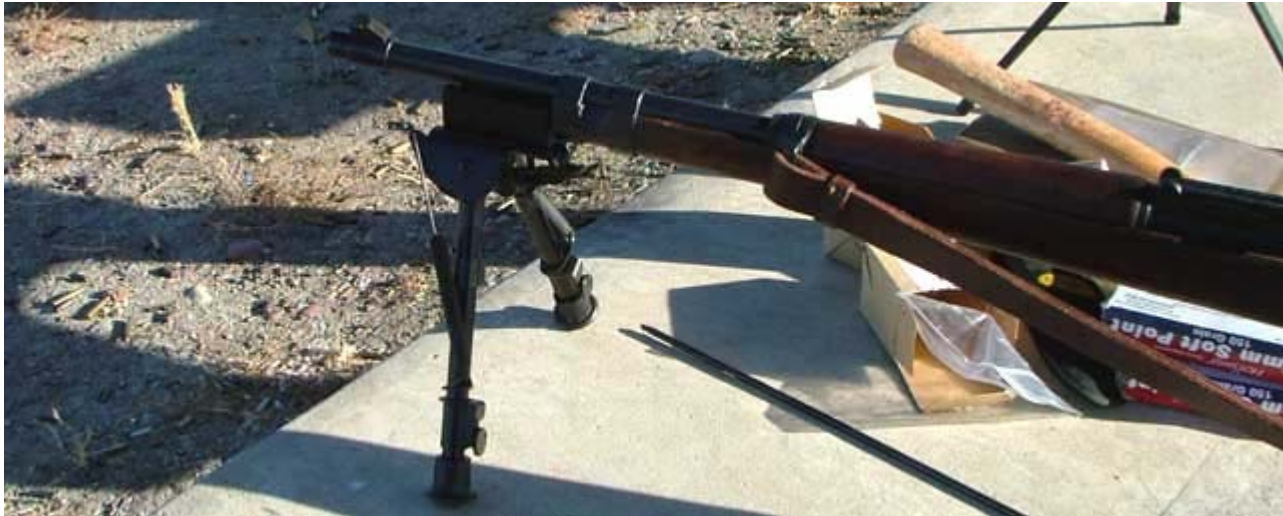
BIPOD MOUNT for MAUSER 98