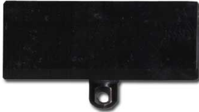
Figure 2. Side view of mount. Note swivel stud for mounting of bipod.