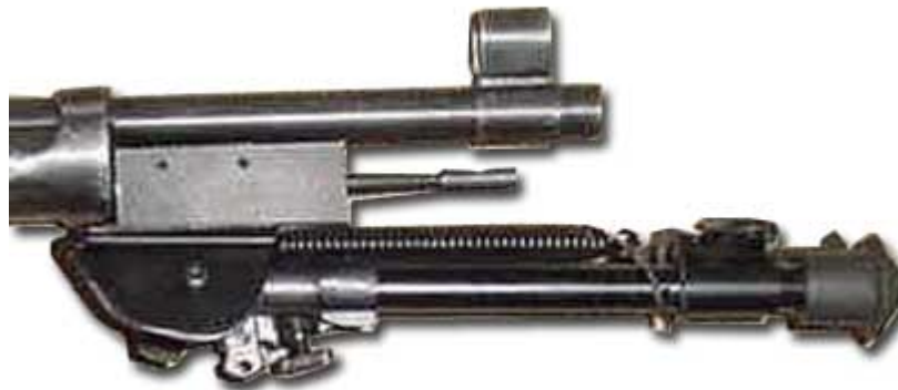
Figure 3. The mount installed on a 98k rifle with bipod installed.

Keep in mind that this is not a setup that is appropriate for bench shooting. Because the mount sits far forward it is difficult to shoot from a bench or table. I was able to shoot on the bench pictured in figure 4 because of the bench design. This type of mount is more appropriate for prone shooting (lying down). As I said before,