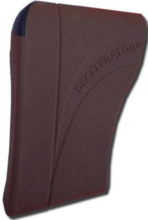
Figure 1 Pachmayer® Decelerator® slip-on recoil pad

The Pachmayer® Decelerator® slip-on recoil pad is simply an amazing product! Its ability to absorb recoil is far beyond that of simple rubber or pliable plastic materials. Pachmayer® began making Decelerator® pads in the 1980's to their standard configurations. That is, one bought a pad slightly larger than needed, and attached it to the butt stock of their rifle. Lastly, the excess material was ground off so it to fit the shape of the butt stock.